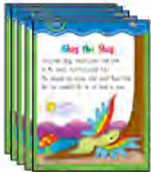
5 Phonics Posters