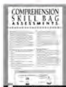
Pre- and Post-Assessment Booklet