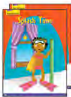
2 Strategy Posters