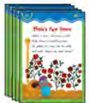
5 Phonics Posters