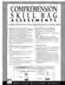
Pre- and Post-Assessment Booklet