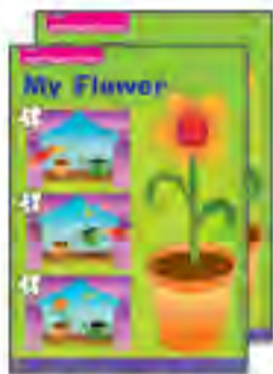
2 Strategy Posters